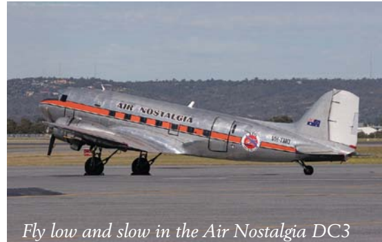
Fly low and slow in the Air Nostalgia DC3